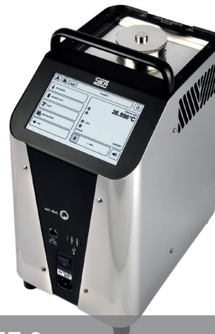
TP 3M165E.2 Stainless steel version