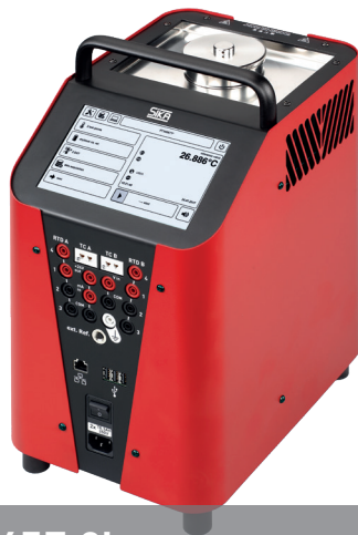
TP 3M165E.2i Integrated measuring instrument