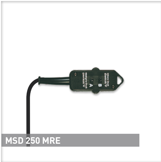
MSD 250 MRE