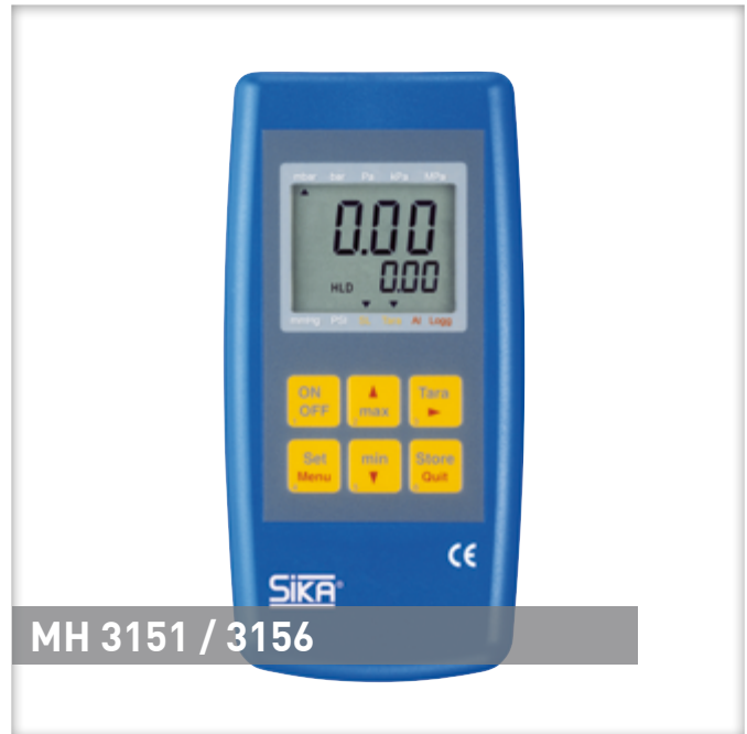
MH 3151 / 3156