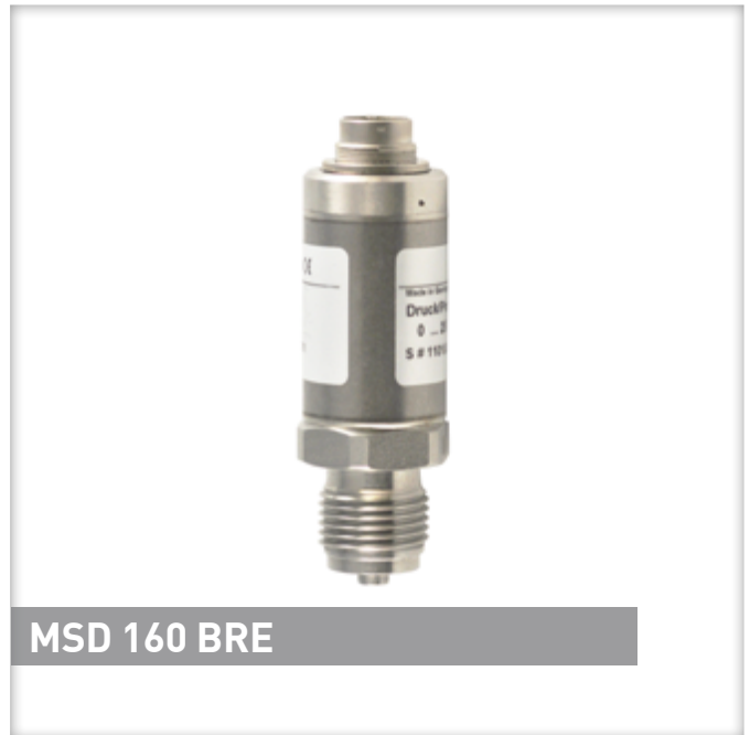
MSD 160 BRE